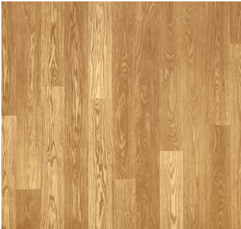
TENNESSEE RYE OAK 01

UniClic Click and Lock Installation- Requires Foam Roll Underlayment Purchased Separate