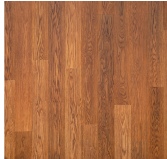
SMOOTH AMBER OAK 03