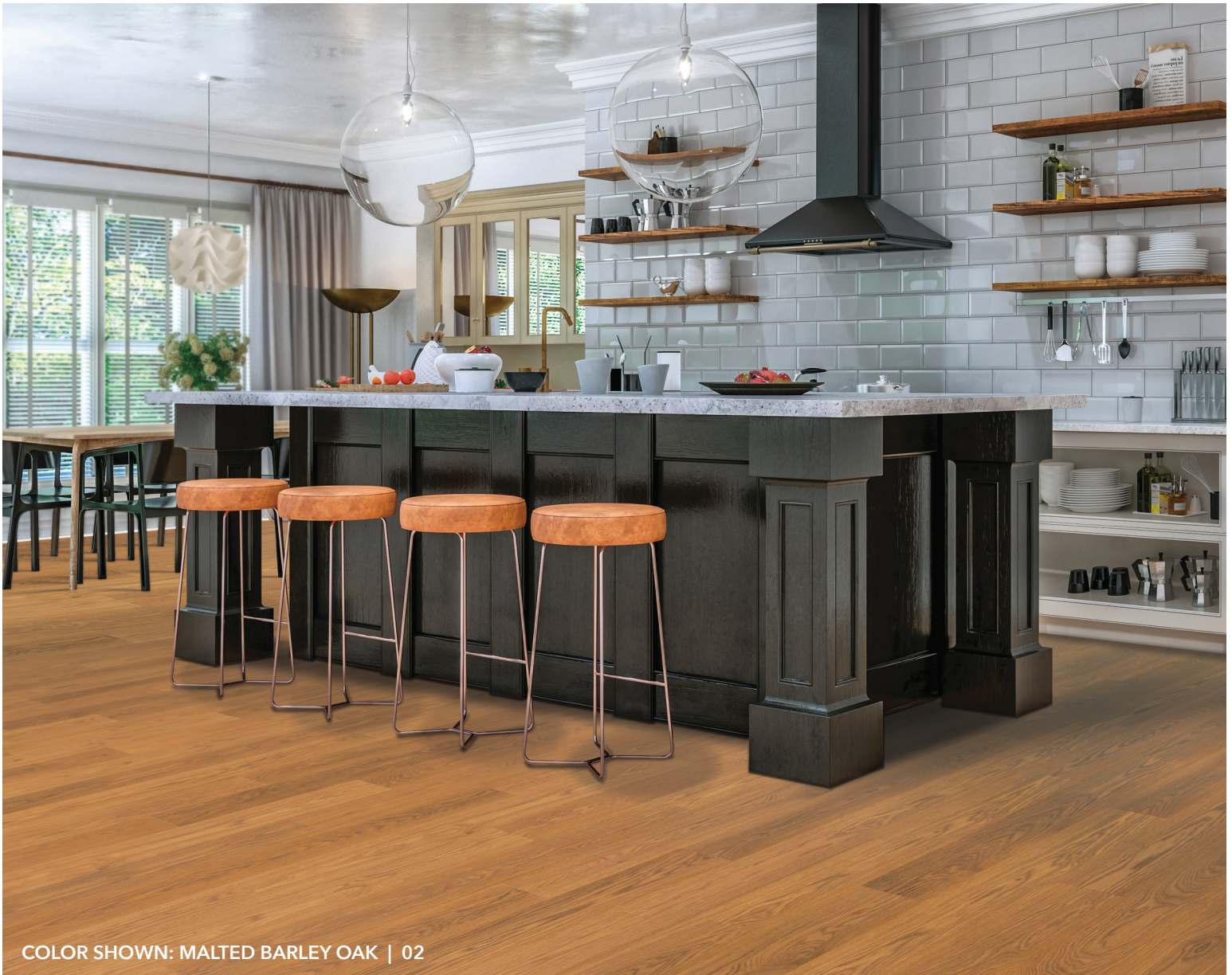
COLOR SHOWN: MALTED BARLEY OAK | 02